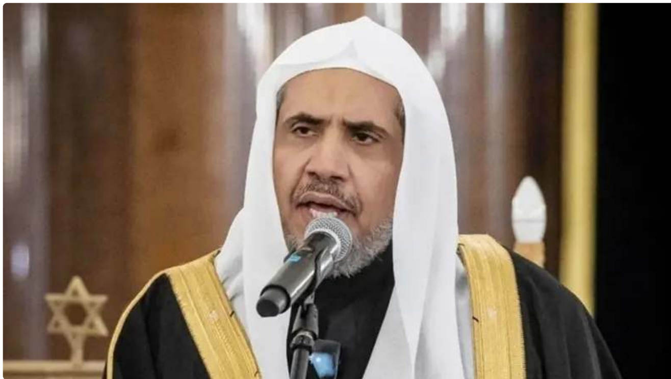
Secretary-General of the Muslim World League Muhammad bin Abdul Karim al-Issa.